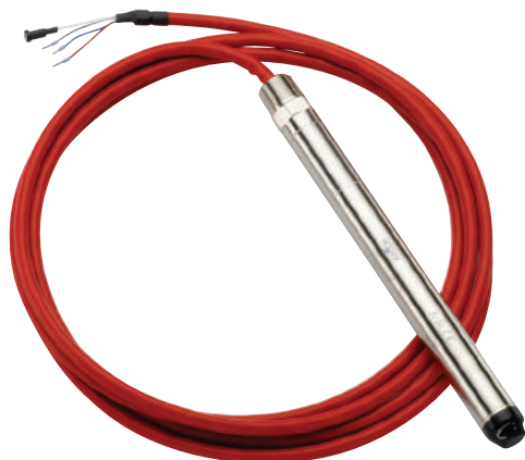
Shown with optional NPT conduit and optional FEP cable